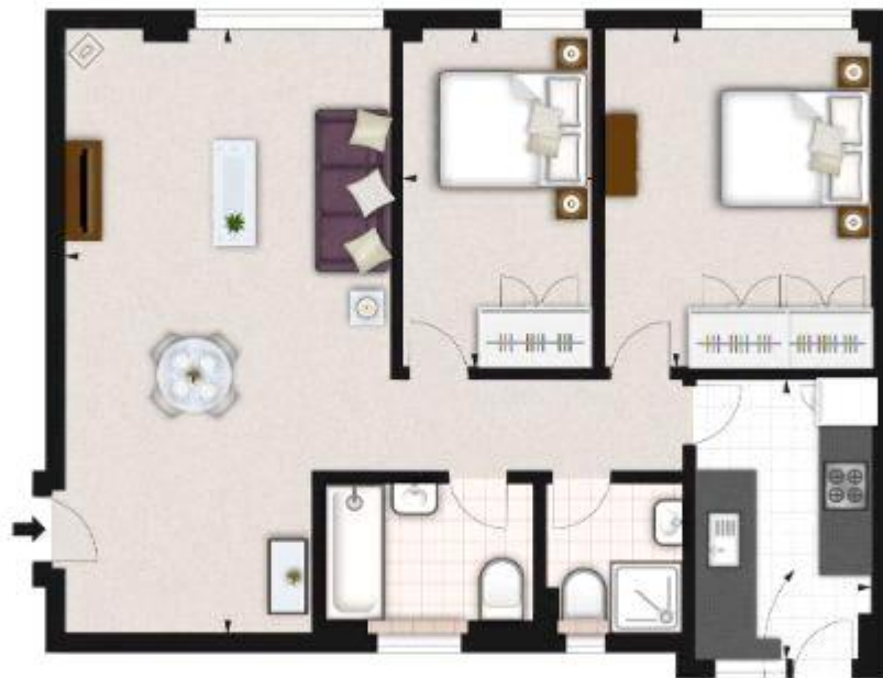
ILLUSTRATION FOR IDENTIFICATION PURPOSES ONLY, NOT TO SCALE * As Defined by RICS - Code of Measuring Practice

APPROX. GROSS INTERNAL AREA * 729 Ft 2 - 67.72 M 2